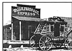
WELLS FARGO OFFICE

The Dakota Hotel was moved from Draper. Built in