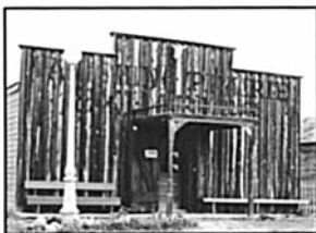
VANISHING PRAIRIE EXHIBITS

From the barn, the whole town lies before you in a beautiful panoramic view. The first building on the north side is the Vanishing Prairie Museum. The museum was built to house the more valuable collections, many from the General Custer period. Items displayed are a pair of boots and an old army saddlebag from the Custer battlefield that were found at an Indian campsite, parade helmets worn by U.S. Cavalry Indian Scouts with the crossed arrow insignia, Indian dolls, arrowheads, a complete authentic cowboy outfit, photographs, and selected interiors of fine